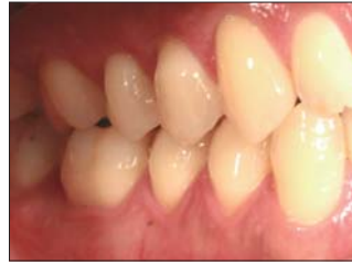
Post-op view of the same side