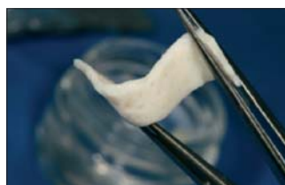
... rehydrated and cut in strip