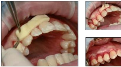
Placing the Alloderm under the raised tunnel flap