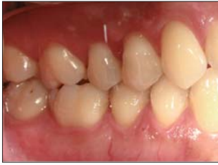
Pre-op mirror view of the left side