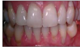
A clinical case of generalised gingival recession in a patient with thin gingiva biotype and high muscular insertion.