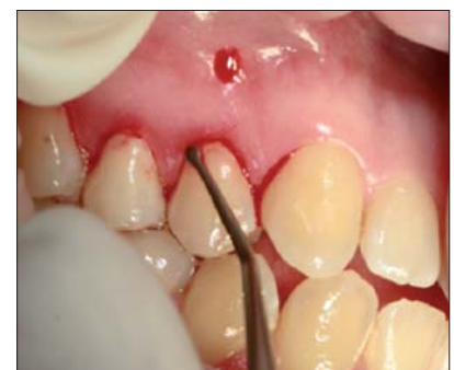
Tunnel periosteum used to raise the flap