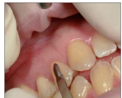
Swann Morton surgical blade used for the cervical incision