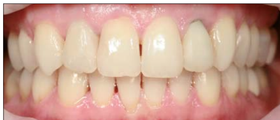
Clinical picture showing a 'dark margin' of a PFM crown in a thin gingiva biotype patient having multiple recessions.