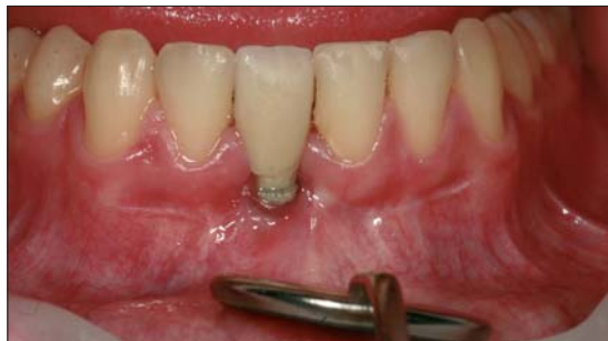
Clinical picture demonstrating gingival recession around an implant.