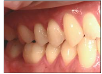
Post-op mirror view of the same side